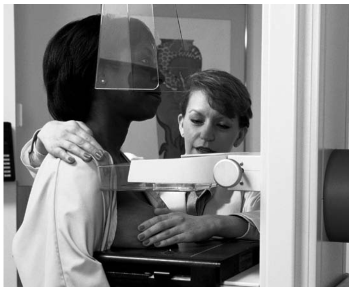
Woman getting a mammogram

Having a mammogram is uncomfortable for most women. Some women find it painful. A mammogram takes only a few moments, though, and the discomfort is over soon. What you feel depends on the skill of the technologist, the size of your breasts and how much they need to be pressed. Your breasts can be more sensitive if you are about to get or have your period.